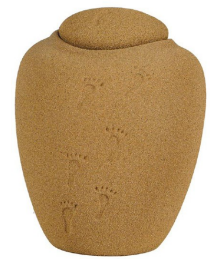
OCEANE SAND $1000