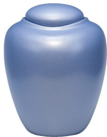
OCEANE BLUE $590